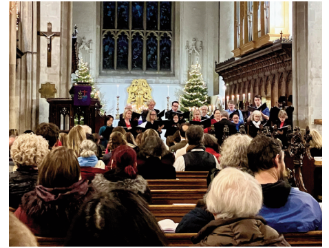
The St Augustine’s Singers, Great St Mary’s

“Perhaps the highlight of the service was the performance by youngsters from Ely College.”