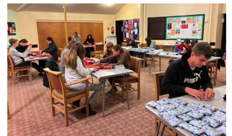
St Mary's Youth Group

Our thanks to the youth group at St Mary's Church in Ely who very kindly gave up their time to wrap the vast