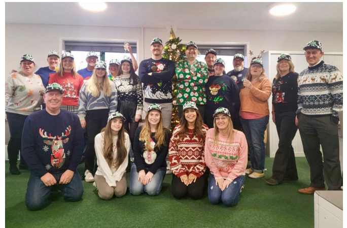
Staff members of ED&F Man Ltd wearing their Christmas jumpers on Christmas Jumper Day in aid of AKPA

Our thanks and best wishes to all at ED&F Man for a wonderful seasonal fundraising effort.